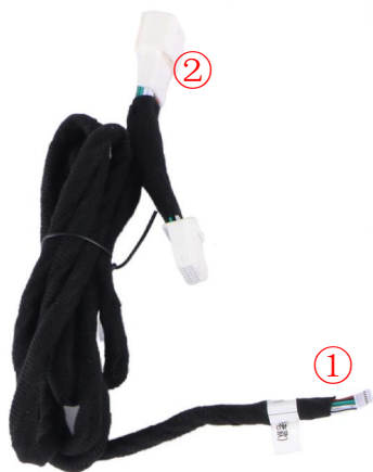
Intel Version - Harness