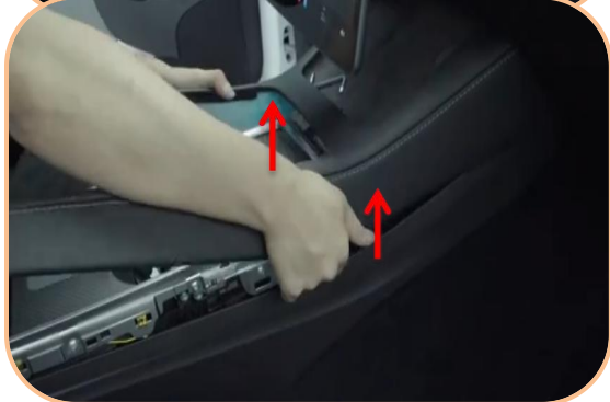
6. Remove the center console trim panel cover