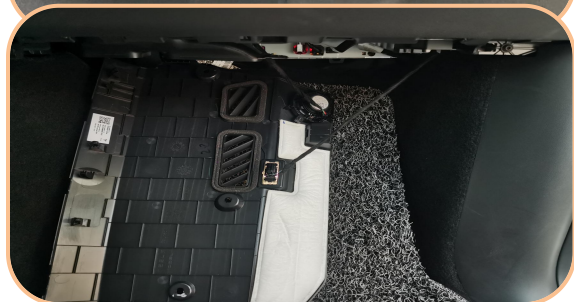
8. Remove the upper cover of the passenger side's footwell