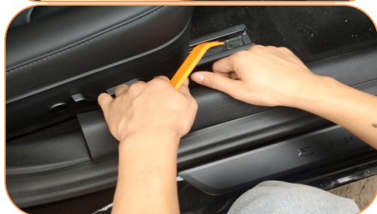
9. Then remove the side cover plate of the passenger side's footwell