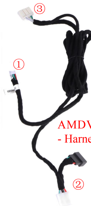
AMDVersion - Harness